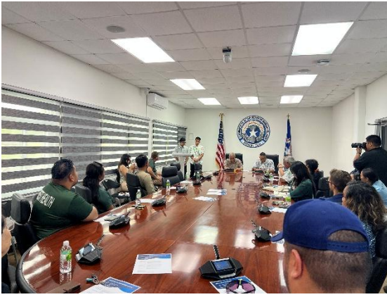
Proclamation signing for Arbor Day