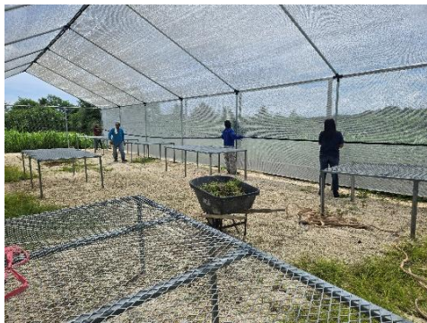
The new forestry nursery facility will soon be completed to begin serving the island