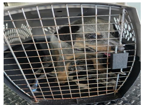
Feegan, a Blue Healer breed dog from Guam, recently arrived at his new home on Saipan on October 10, 2025