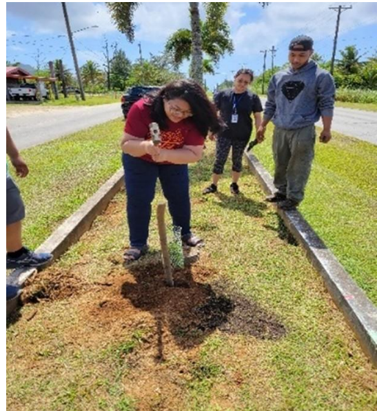
Mayor Aubry Hocog took time out from her busy schedule to help plant trees along the road to the Rota Airport

DOA also administers the Specialty Crop Block Grant Program , funded by the USDA Agricultural Marketing Service, which enhances the competitiveness of specialty crops. Specialty crops are defined as fruits, vegetables, tree nuts, dried fruits, horticulture, and nursery crops, including floriculture. Other programs from the USDA Agricultural Marketing Service include the Micro Grants for Food Security Program and the H.R. 133 Stimulus funding, which encourages states to prioritize projects addressing the impacts of COVID-19.