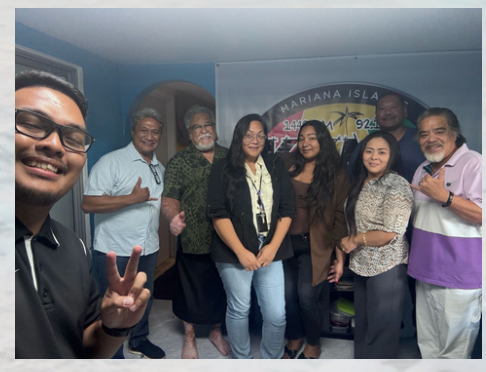
SAAR Team with our KKMP Family, sharing our services.