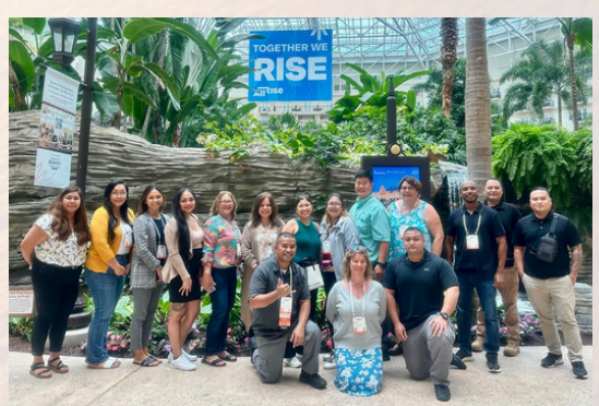
Team CNMI at 2025 All Rise in Orlando, FL