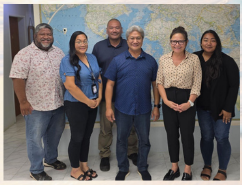
Meeting with our US Delegate, Congresswoman Kim King-Hinds to address our issues here in the CNMI.